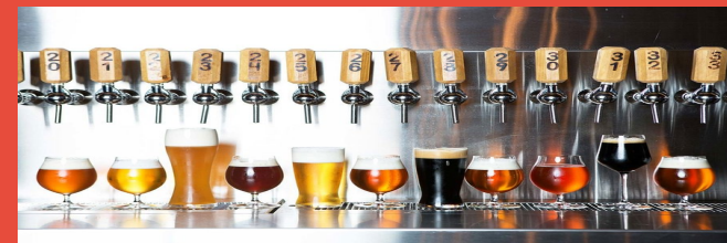
The Commish's Ingredient Pool