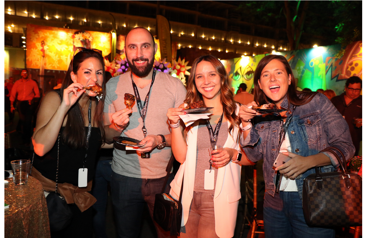
People who will enthusiastically enjoy our beer

Save $5 on your ticket with promo code 5OFF at www.veritagemiami.com